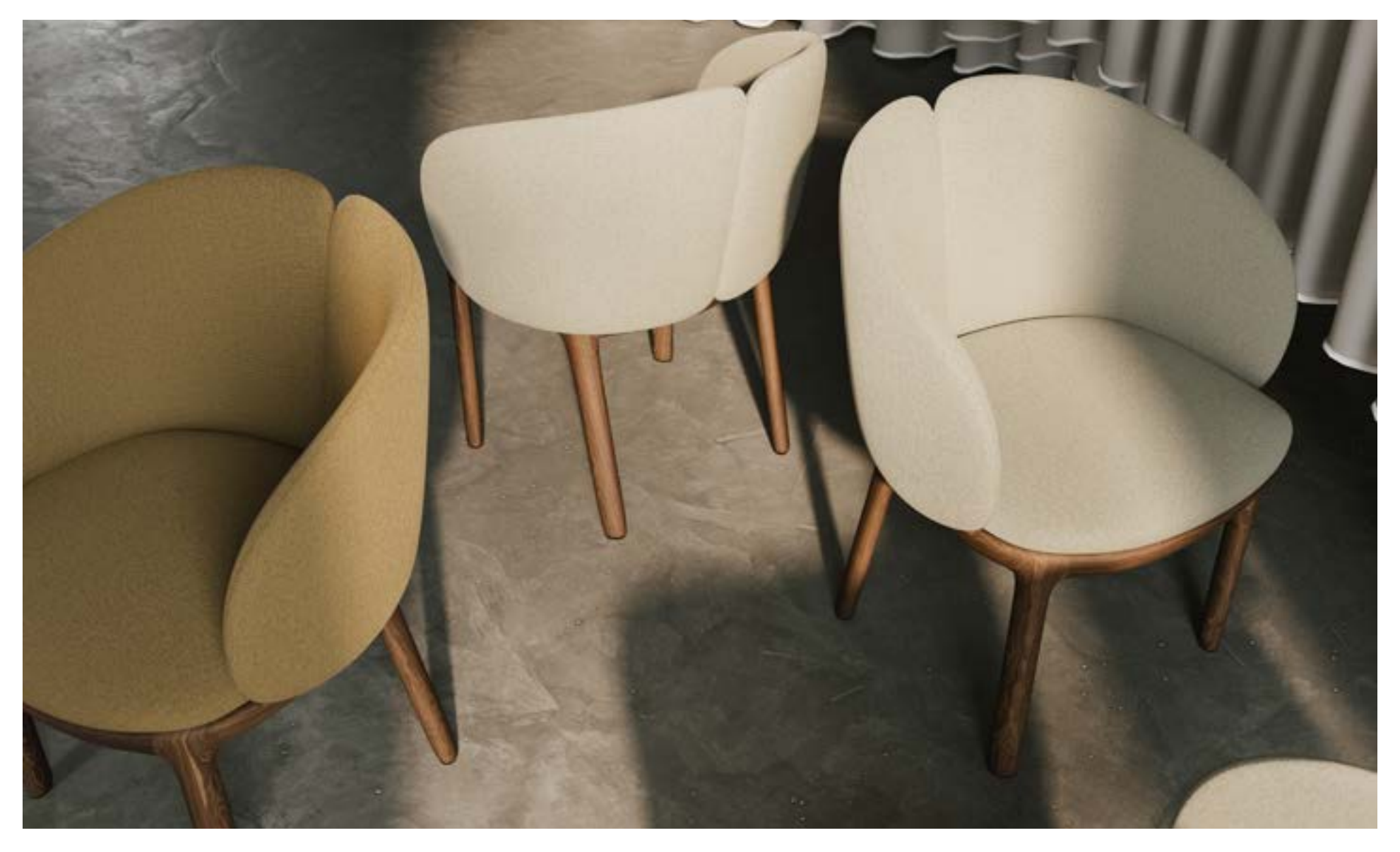
Heartfelt Price List