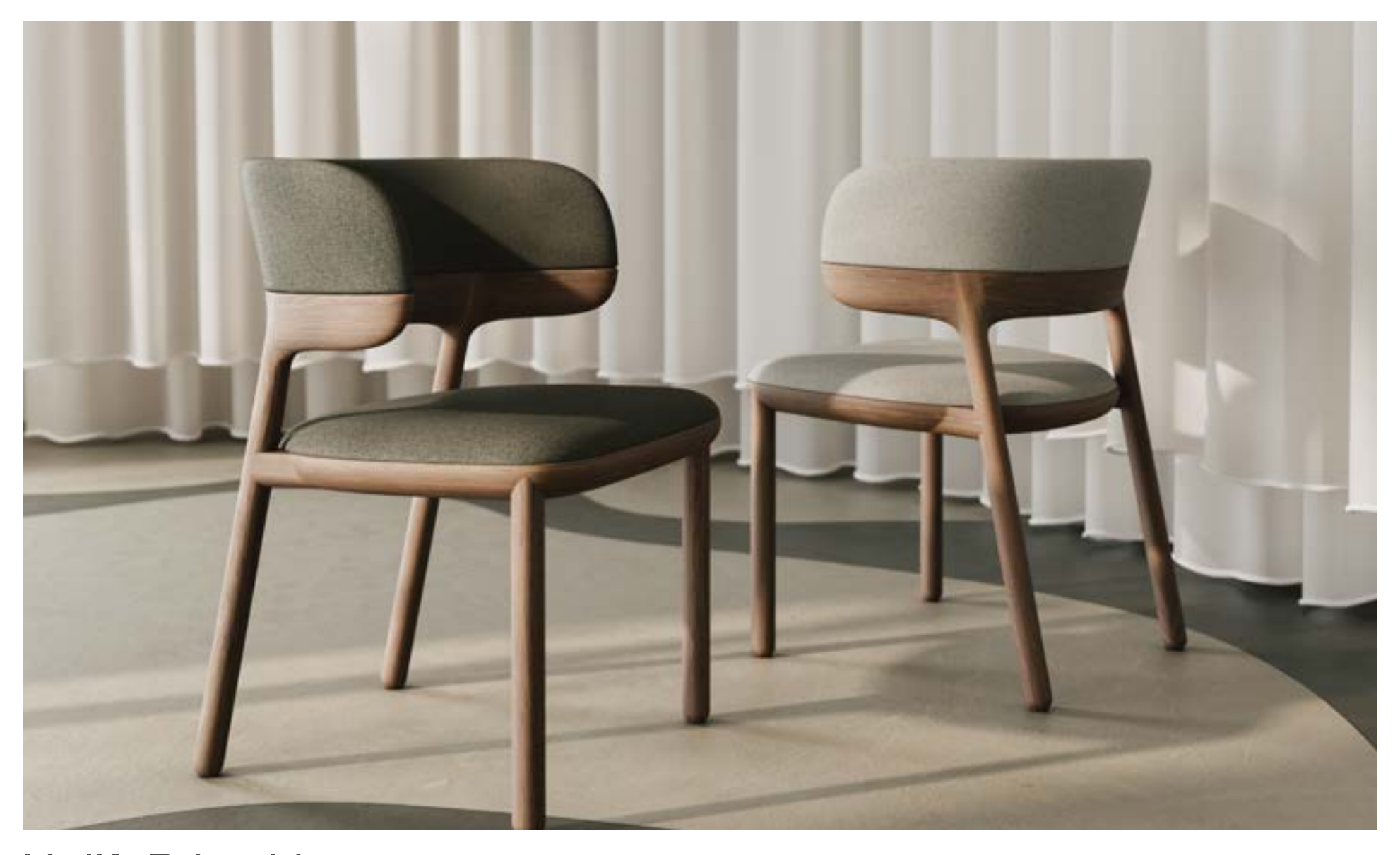
Uplift Price List