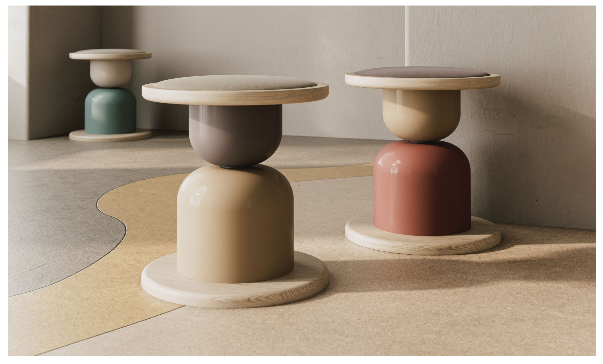
Teo Price List